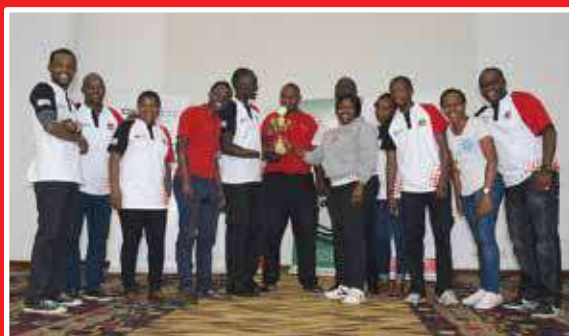
E-Plus staff awarded the best Emergency Medical Technicians (EMT) during National First Aid Competition - 2018