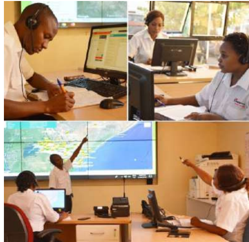
A state-of-the-art E-Plus Medical Dispatch Centre